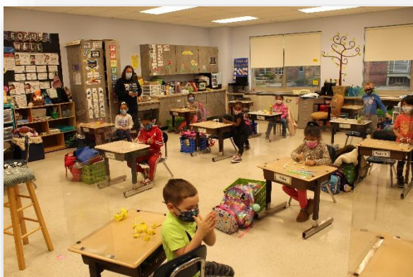
This is the new norm!

I’m sure as a parent or a guardian, you are concerned as well.