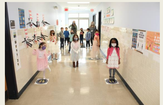
We are all dressed up for success!!!