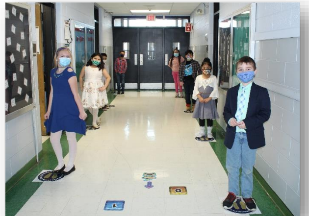
Our scholars dressed for success!