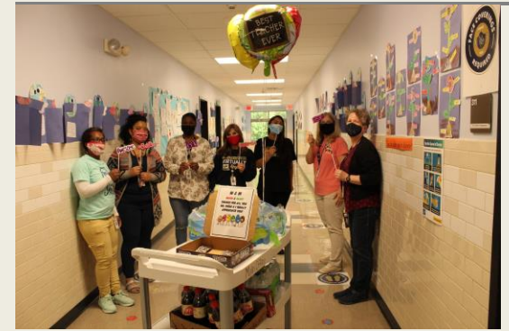
Staff Appreciation is every day!!!