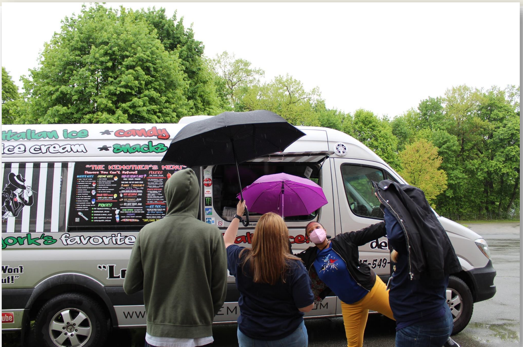
Our staff enjoying a scoop of their favorite ice cream – during a week of Appreciation! (We actually appreciate them every day...)