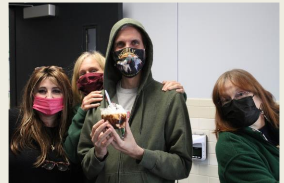
Ice Scream makes us happy! (Thank you to NWS PTO!)