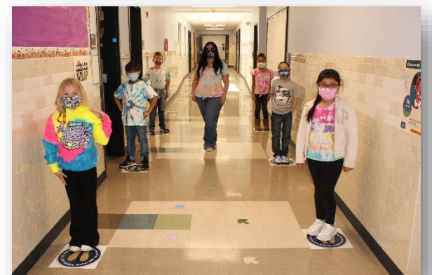
We take social distancing very seriously!