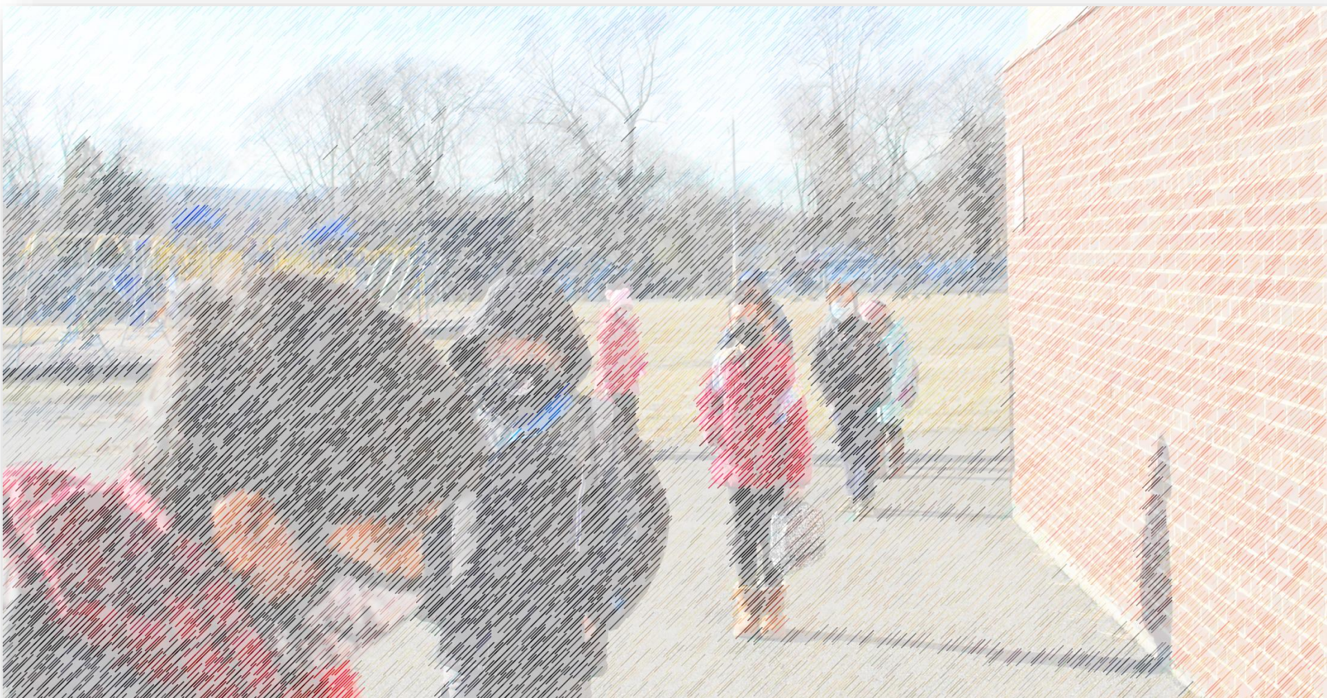
Students arriving at NWS for another amazing day of learning!!! They are sooo good at following the rules!!!