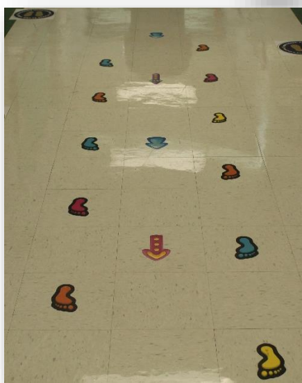
Social distance, please