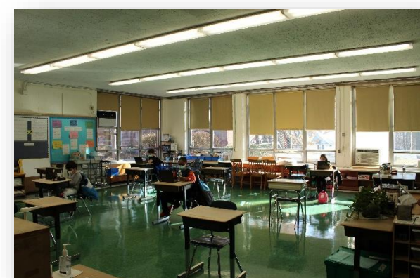
We have kids in our classes! We need more!

We have a responsibility to share that same practice with our children. Being a parent myself, I understand how kids tend to do what we do and not what we say. So the best example I can set for them is to read. Read with them, read next to them, have them read to you. Talk about what you’ve read together. Give every opportunity for your child to read as much as possible.