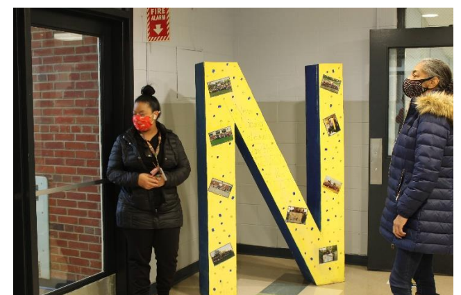
We take social distancing very seriously!

If you need Parent Portal information, please reach out to our secretary @ jgiusto@necsd.net and she will assist you in getting the proper information.