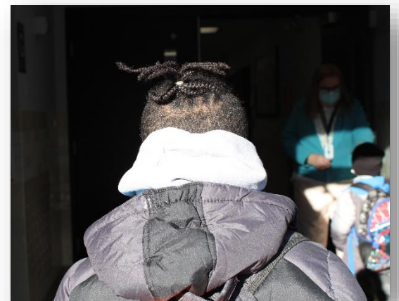
Our scholars getting ready for an awesome day of learning!